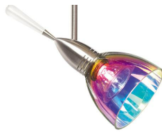
AERO WITH DICHROIC GLASS SHIELD ACCESSORY