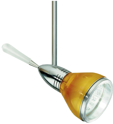
AERO WITH ROUND GLASS SHIELD ACCESSORY Shown approximately 35% actual size.