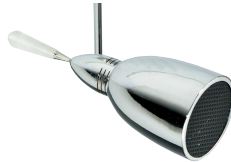
AERO WITH BELL ACCESSORY