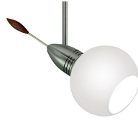
AERO WITH MOONLET AND WOOD HANDLE ACCESSORY