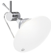
SPROCKET WITH SHY ACCESSORY