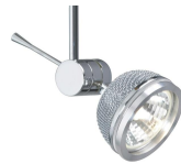
SPROCKET WITH STEEL WHEEL ACCESSORY

Socket terminates with FreeJack male connector, which may be installed into a system connector. Elements ordered with a system prefix include a lconnector for that system.