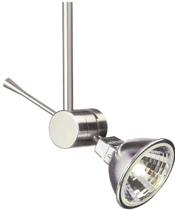
SPROCKET Shown approximately 55% actual size.